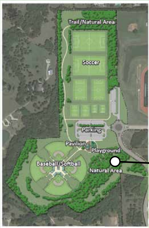
2018 MASTER PARK PLAN RENDERING

50 ACRES FOR PUBLIC PARK WITH HIKING TRAILS & PARKING